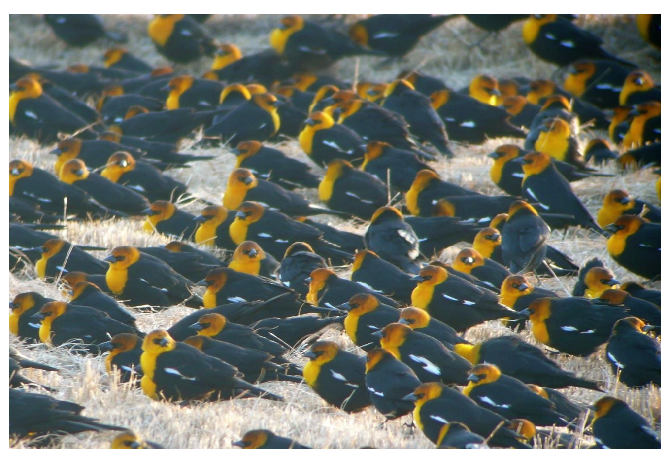
Yellow-headed Blackbird roost outside of El Paso, TX

<u>January 9, Day 1: Arrival in El Paso</u>. Participants should plan to arrive in El Paso today. A complimentary hotel shuttle is available from the airport to the Wyndham Airport Hotel. The hotel is located just a couple of hundred yards away from the airport baggage claim area. We will meet in the hotel lobby at 3:00 p.m. for a visit to a huge Yellow-headed Blackbird roost (some years numbering thousands of individuals) in west