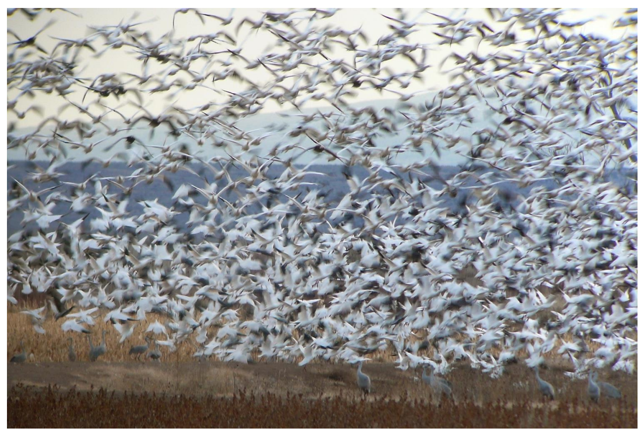
Snow Geese, Bosque del Apache NWR

January 14, Day 6: Bosque del Apache National Wildlife Refuge/ Bernardo Waterfowl Complex and Sandia Crest. A very early start this morning (breakfast at about 5:15 a.m.) will find us returning the refuge or heading north to the Bernardo Waterfowl Complex hoping to witness the incredible dawn flight of geese (sometimes numbering 20,000 or more) and cranes (5,000-15,000). The sights and sounds of such an extravaganza are truly unforgettable! The symphony of honks, rattles, and trumpets plays throughout the morning as we make our way around the refuge tour loop.