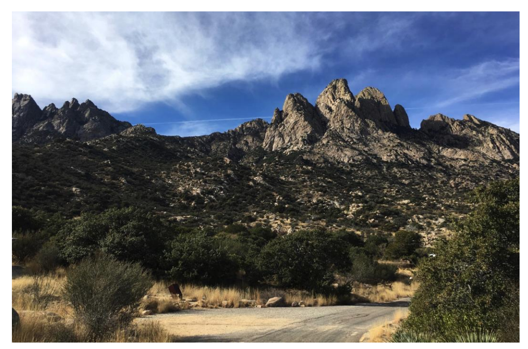
Organ Mountains/Desert Peaks National Monument

In the late afternoon we will check the desert basin grasslands of the Jornada del Muerto or "Journey of Death," so named because this extensive, waterless region spelled the doom of many early travelers. A variety of raptors and sparrows can be found here. Black-throated, Sagebrush, and Brewer's sparrows, as well as Lark Bunting are all possible; and we could encounter Golden Eagle or Prairie Falcon, as well as the often elusive Crissal Thrasher.