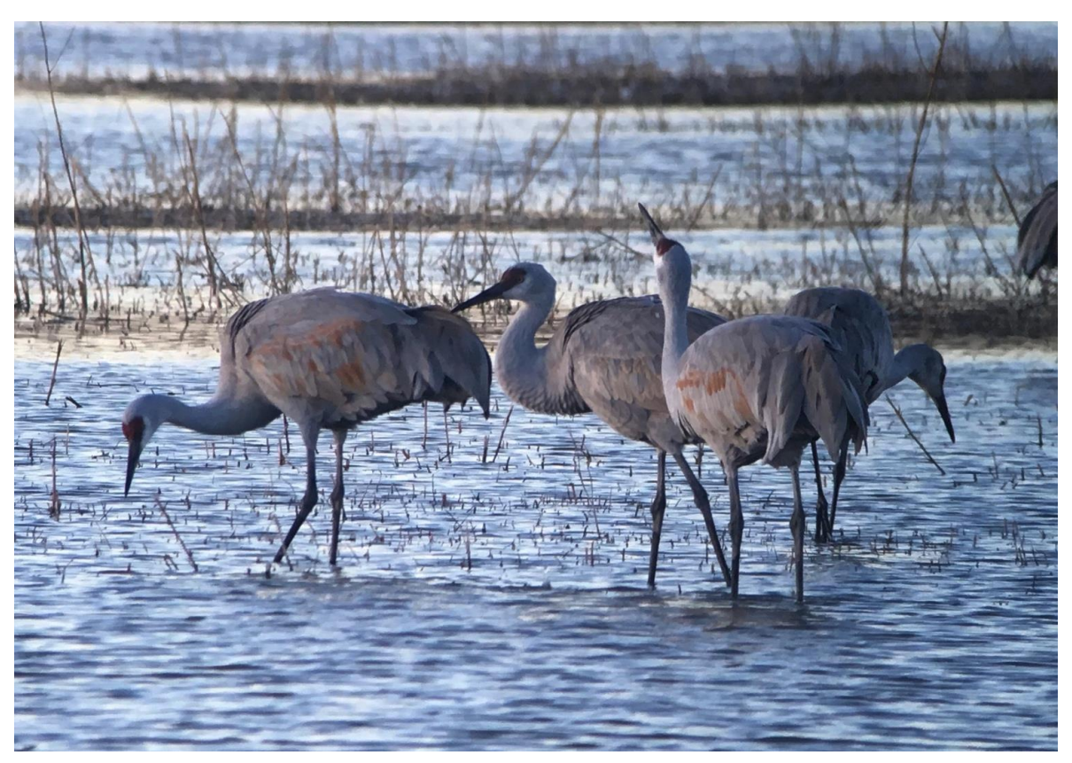
Sandhill Cranes, Bosque del Apache NWR

Each year the Rio Grande Valley of central and southern New Mexico plays host to an incredible array of wintering bird species. Tens of thousands of geese, ducks, and cranes descend on famous Bosque del Apache National Wildlife Refuge and the Bernardo Waterfowl Complex, as well as Caballo and Elephant Butte reservoirs. Sparrows, some years in astonishing numbers and variety, cover the desert grasslands and riparian thickets. Drawn by the abundant prey, raptors abound with a combined total of 17 hawk, falcon and owl species possible. In short, this avian-rich area is a mecca for winter birding.