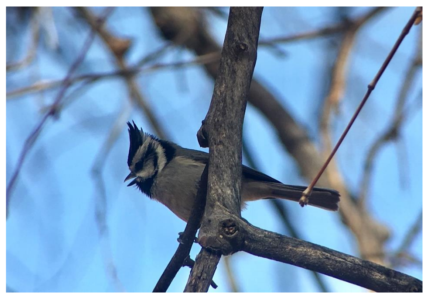
Bridled Titmouse, Animas Creek

January 13, Day 5: Elephant Butte Lake, Water Canyon, and Bosque del Apache National Wildlife Refuge. On the way north towards Socorro, we will briefly check Elephant Butte Lake for any waterbirds we may be missing. As with Caballo, this reservoir turns up a wealth of vagrants each year. Clark's